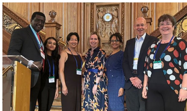
SOM Board members at our Annual Conference 2024 in Belfast

SOCIETY OF OCCUPATIONAL MEDICINE 2 ST ANDREWS PLACE, LONDON NW1 4LB