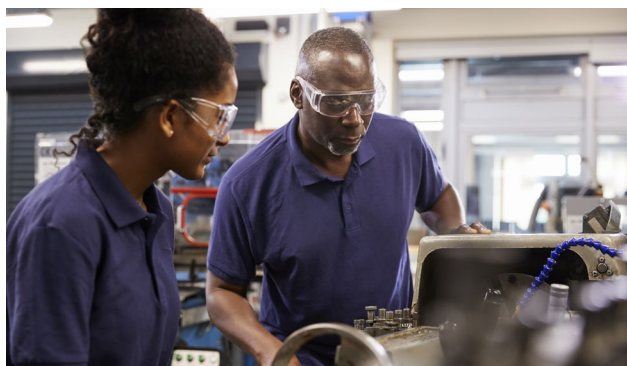
SOM hosts a Musculoskeletal at Work Network