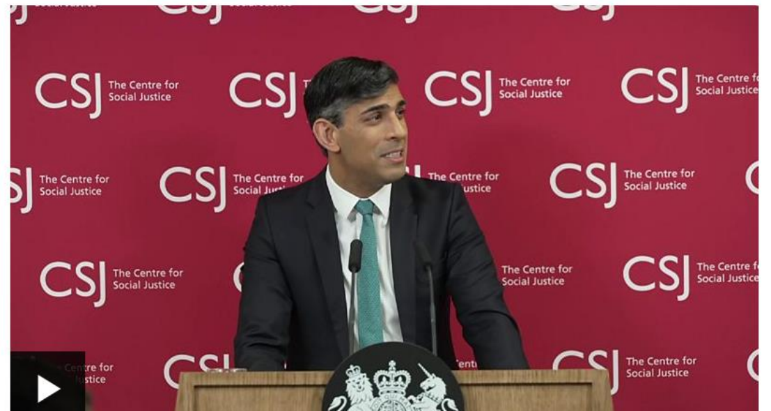
Rishi Sunak sets out plans to tackle 'sick note culture' - BBC News